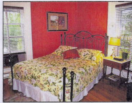
The Cove Inn in Westport, (left) and the Rosemount Inn in Kingston (below) and are two cozy inns to escape to this winter.

Eating breakfast in the Tapestry Room envelopes you in the past. The William Morris-designed wall covering was the talk of the town when it was installed. The glorious tapestry remains a symbol of the house's opulence. www.perthmanor.com .