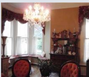
The Victorian sitting room of the Secret Garden Inn, Kingston, Canada

Just two hours from either Toronto or Ottawa by VIA Rail train, the city of Kingston, Ontario, is a treasure trove of historic landmarks and picturesque Victorian heritage homes.