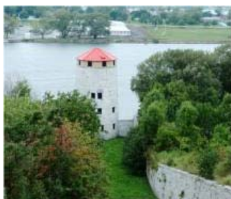
One of four Martello towers built in Kingston to defend the harbor