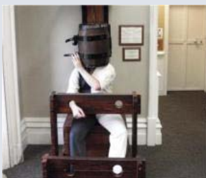
A Kingston Penitentiary museum docent in period garb, demonstrates the use of the 'drowning' water torture device